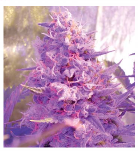
Ripper Quake Polm