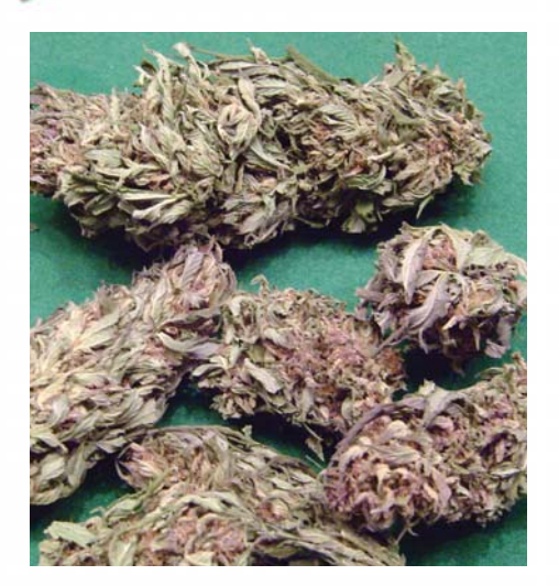
BC Blue God