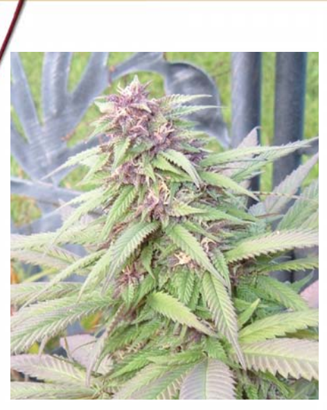
BC Blue God